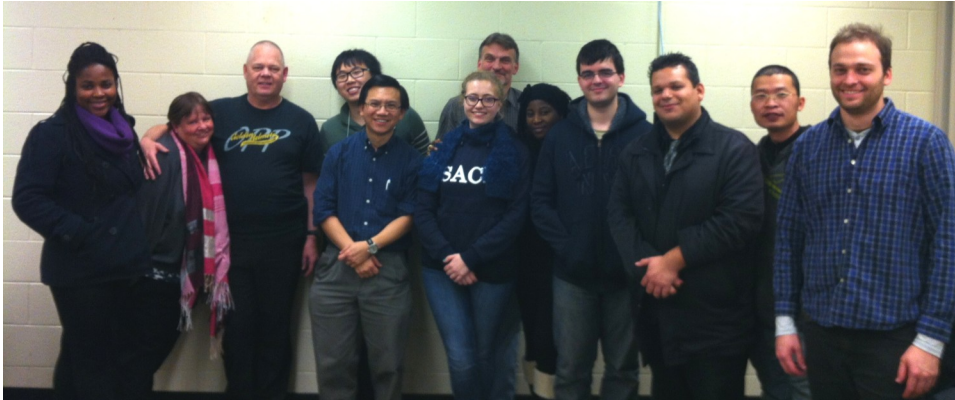
Some of the TOP regulars at our last 2014 gathering

Theology over Pizza (TOP) is my ministry's weekly program that creates a safe space for people to ask their faith questions in order to help them grow in faith and see the relevance of Christianity. Here is a testimony from a TOP regular: