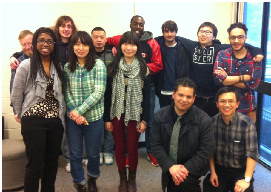
Some of the TOP regulars at our last April 2015 gathering

L abor strikes can cause disruptions and create conflicts and tensions within the community. This was the case this year when the contract faculty, teaching assistants and research assistants at York went on strike for the month of March. Classes were initially cancelled but gradually resumed even in the midst of strikes, causing a divided campus among those who support the strike and those who don't.